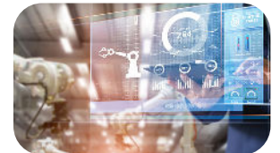
Industrial & Medical