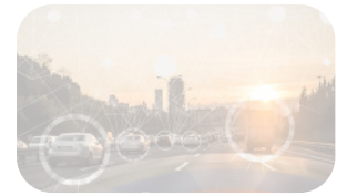
IoT/loV & Optoelectronics