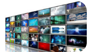
Flat Panel Display