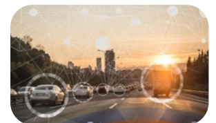
IoT/IoV & Optoelectronics