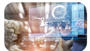
Industrial & Medical